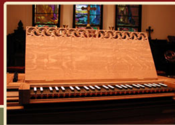
Opus 39, 2001