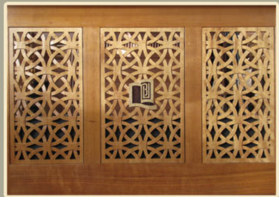
Opus 69 pipe shades