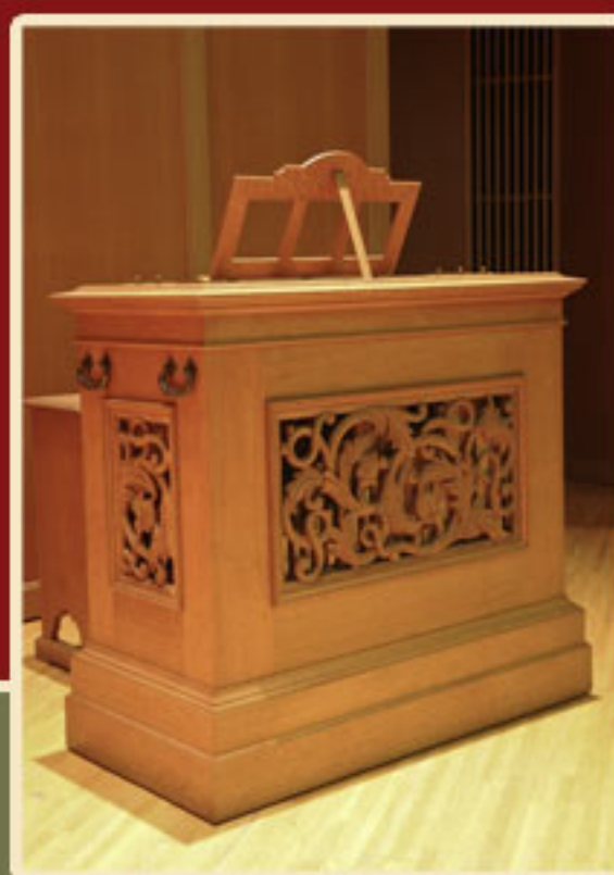
Opus 31, 1995, 3 stops