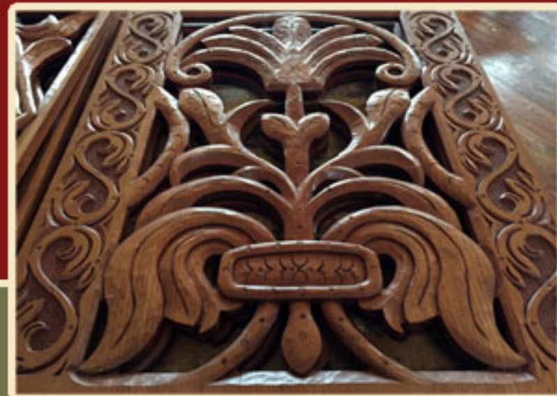
Hadley chest inspired carving for opus 68